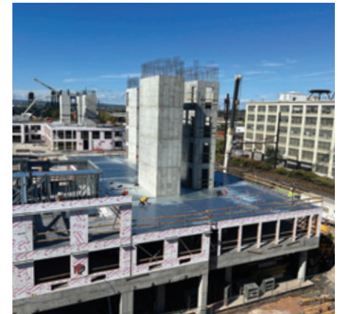
West Side Square apartments taking shape, October 2024

West Side Square is a mixed-use purpose-built rental development in Jersey City, New Jersey. Following the successful IPO of the West Side Square Development Fund in 2023, this project is poised to become a premier destination.