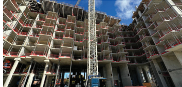
Highland Commons, October 2024