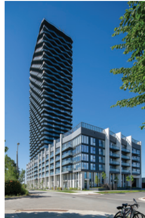
Thirty Six Zorra

“ AS OF MAY 2024, THIRTY SIX ZORRA ACHIEVED A NEW MILESTONE - THE SUCCESSFUL COMPLETION OF REGISTRATION AND FINAL CLOSING!