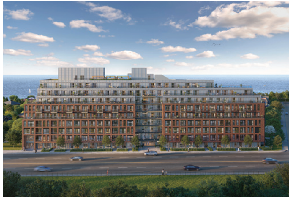
Birchhaus Residence, Streetview