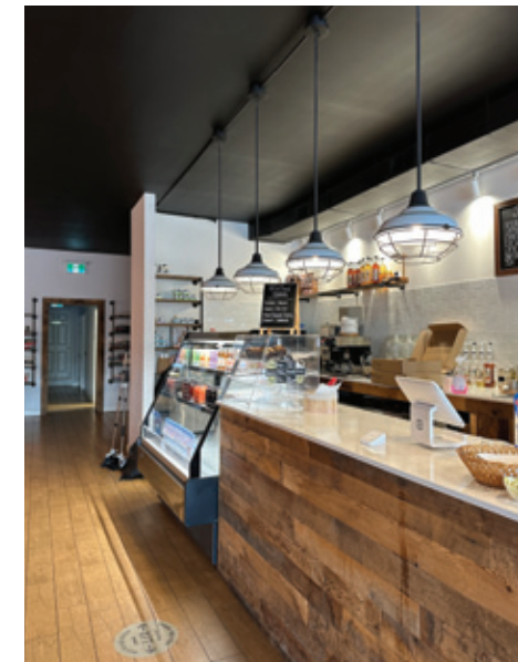
Creek Coffee offers freshly brewed coffee, seasonal drinks, delicious food, and a cozy environment perfect for relaxing or studying