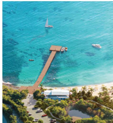
Vie L'Ven Luxury Resort and Residences, Private Dock