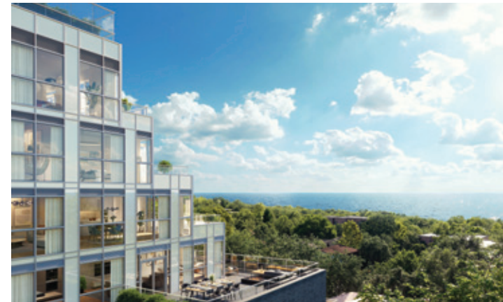
Kingside Residences, Terraces