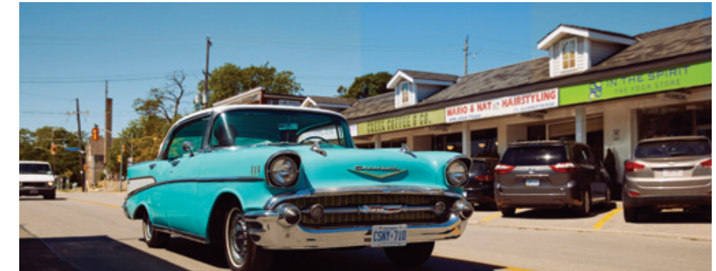
Photo, Shops at Highland Creek

Shop with us today at 360 Old Kingston Road.