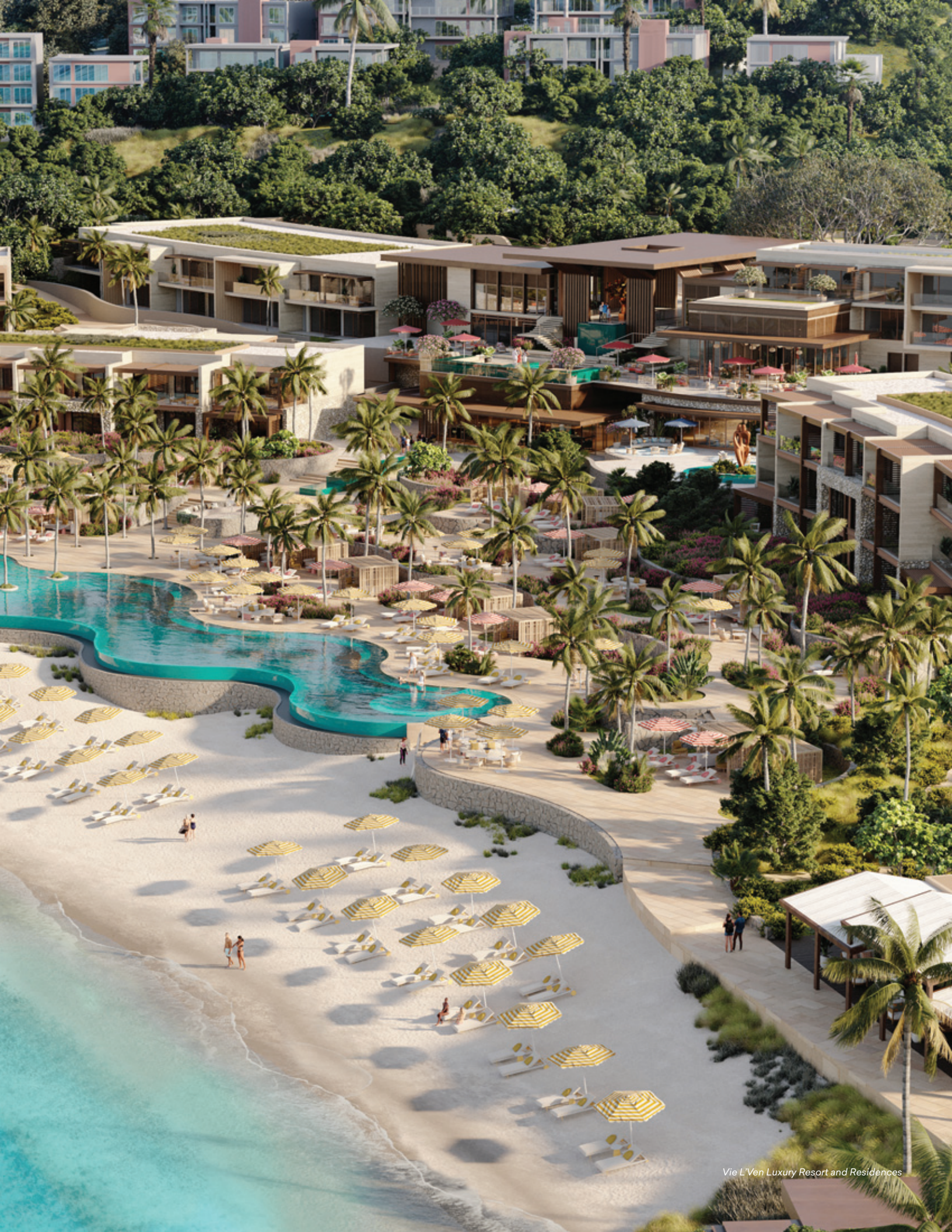
Vie L'Ven Luxury Resort and Residences

The BULLETIN showcases the latest corporate updates and news at Atree Developments.