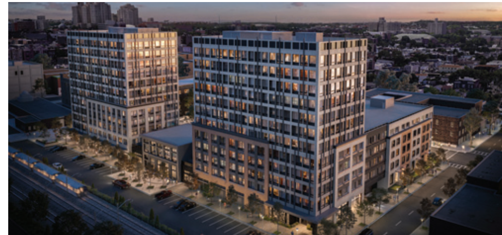
West Side Square, dusk

The crane was installed June 2024, and the structure is rapidly taking shape.