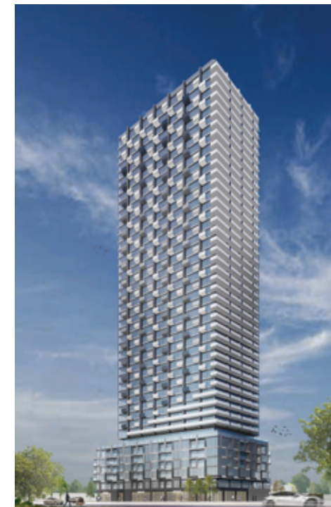
1705 Weston Road, Toronto, Ontario