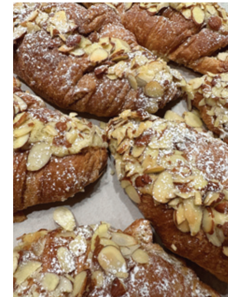
Almond croissants - a best seller at Creek Coffee!