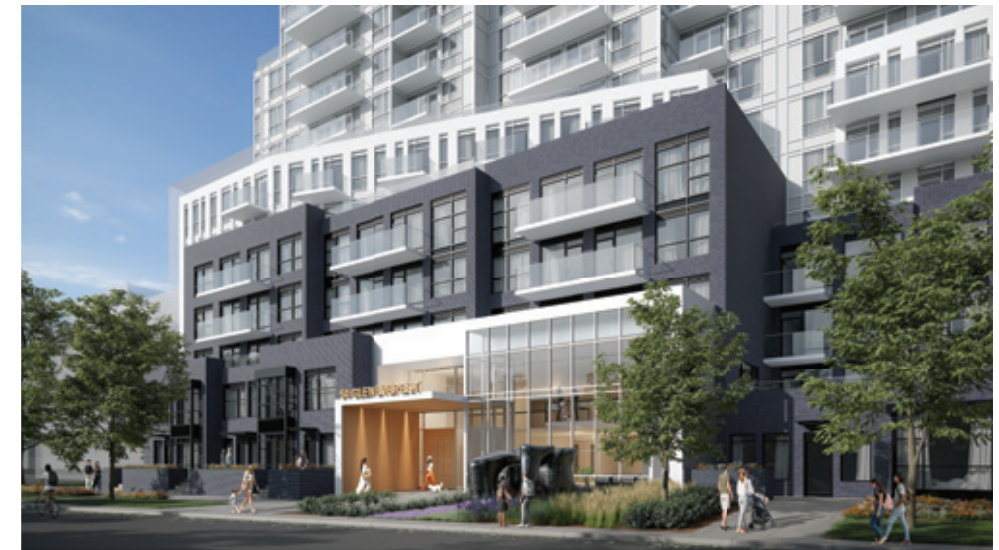
The Everest, Scarborough, Ontario, Canada