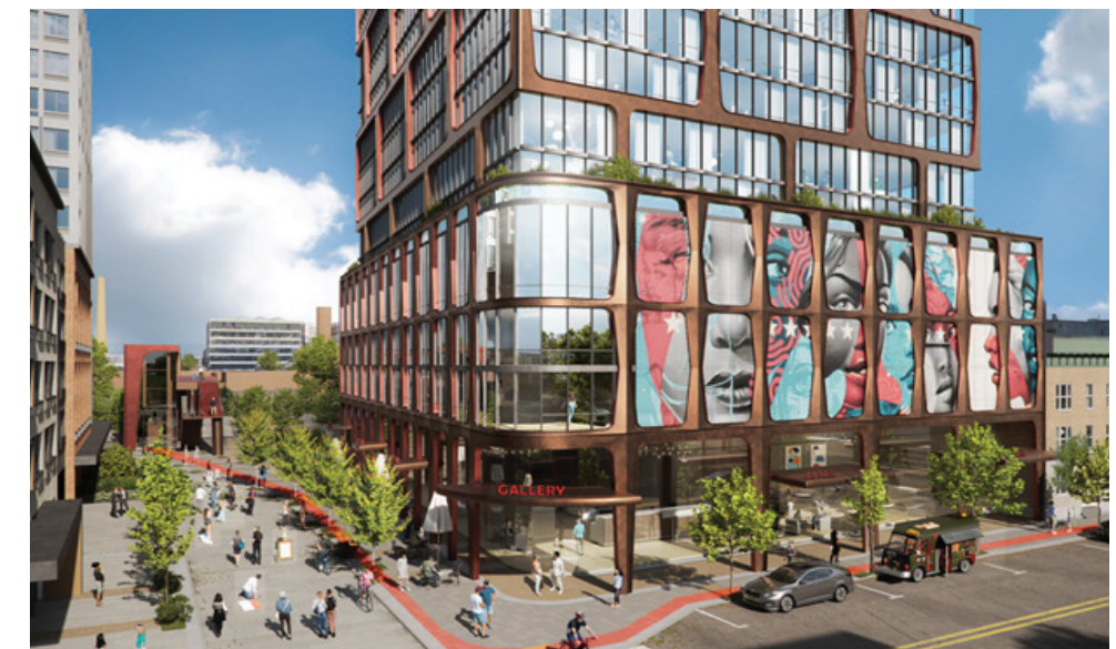
Artwalk streetscape. A planned piazza will seamlessly connect Artwalk to West Side Square, another purpose-built rental just across the street

A standout feature of Artwalk is the planned piazza connecting to West Side Square, enhancing