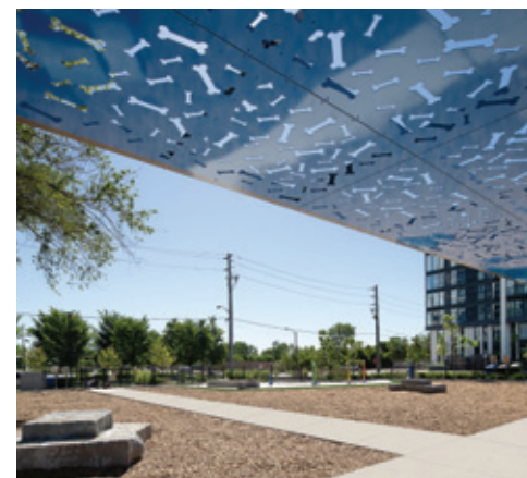
Photo, Zorra Park