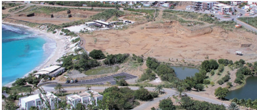
Vie L'Ven Luxury Resort and Residences, construction progress as of October 2024