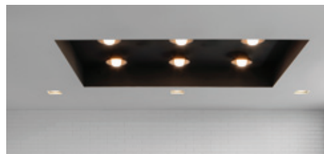
Photo, Arcade Rec Room at Thirty Six Zorra