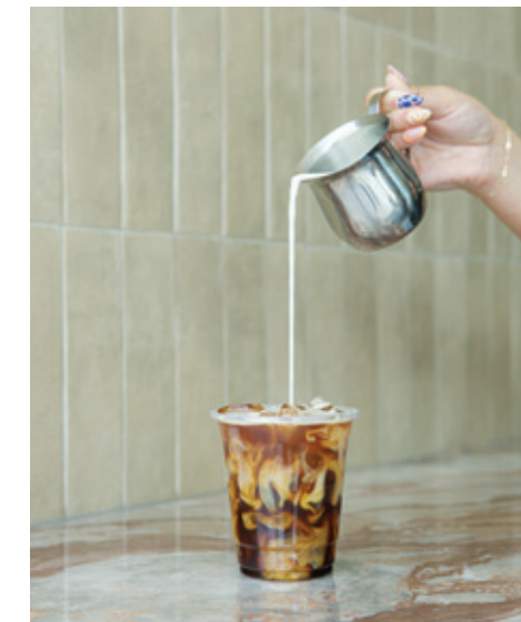
One of our signature drinks at Club 285 Café

Open daily from 8 AM to 5 PM, Monday - Sunday. Visit us at: 280 Viewmount Avenue