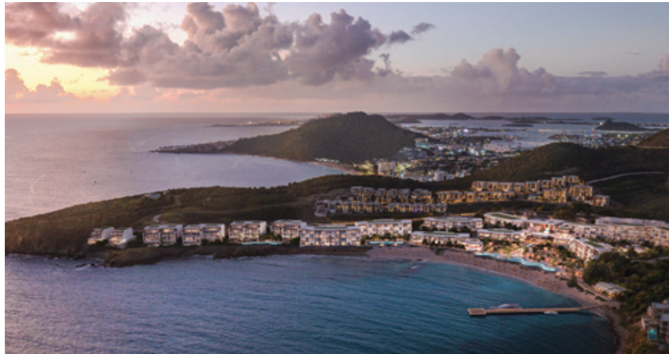
Vie L'Ven Luxury Resort and Residences, Aerial