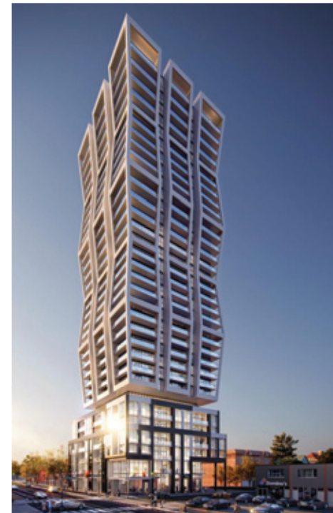
280 Viewmount, Toronto, Ontario