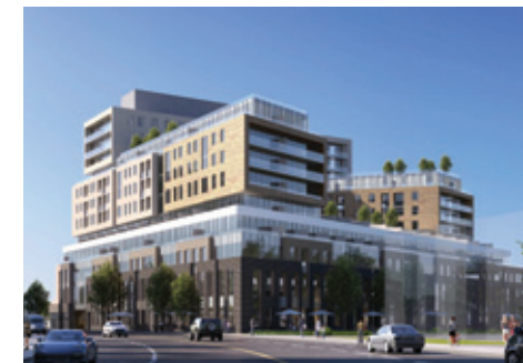
468 Danforth, Scarborough, Ontario