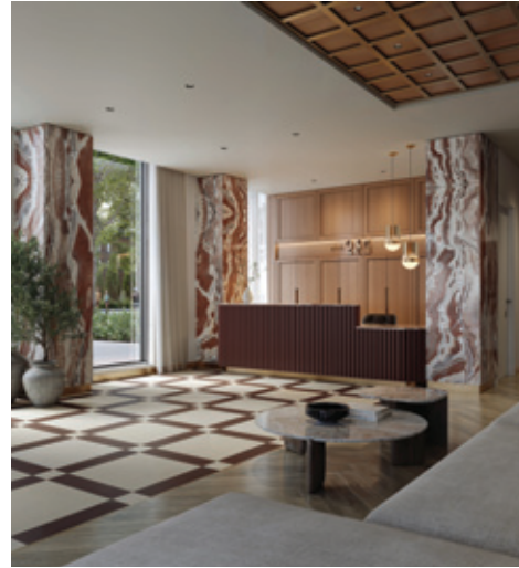
Club 285 Condominiums, Lobby

Club 285 Condominiums, soon to rise at 285 Hillmount Avenue in Toronto's Yorkdale-Glen Park neighbourhood, will feature a sleek, urban living inspired design. This upcoming mid-rise is ideally located just minutes from Glencairn Subway Station, offering future residents modern living with easy access to city transit.