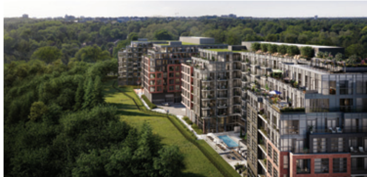
Highland Commons is perfectly situated behind the Highland Creek ravine