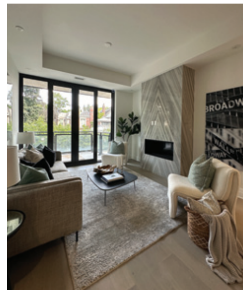
Forest Hill Private Residences, model suite