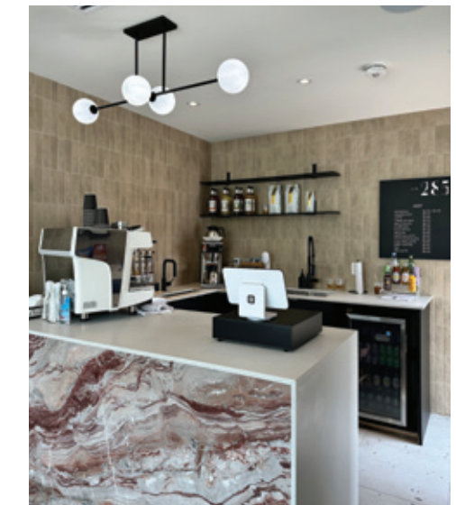
Club 285 Café interior