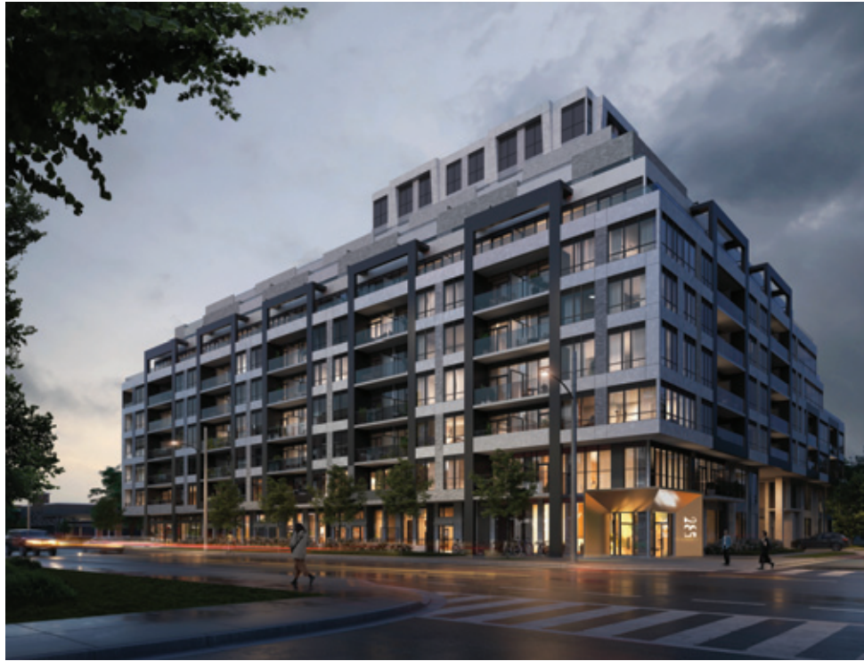
Club 285 Condominiums

Coming soon steps away from Glencairn Station!