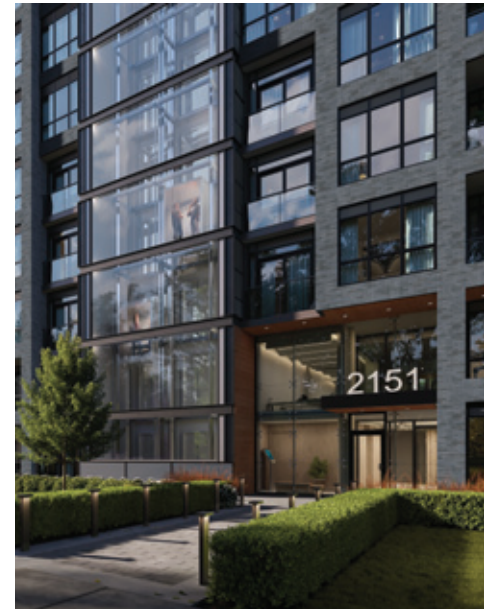
A close up streetscape of Kingside Residences showing the iconic glass elevator, which provides unobstructed views of the downtown Toronto skyline

CONSTRUCTION PROGRESS IS WELL UNDERWAY, WITH THE DEMOLITION PHASE SUCCESSFULLY COMPLETED EARLY JULY 2024.