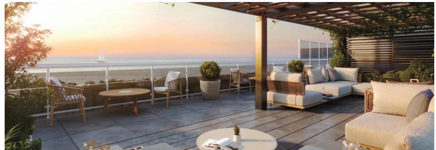
Kingside Residences, Rooftop