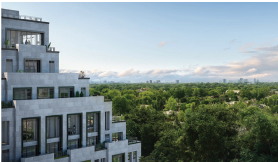
Forest Hill Private Residences