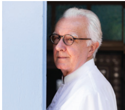
Michelin Star Chef Alain Ducasse

“ VIE L'VEN WILL SET A NEW STANDARD FOR 5-STAR LUXURY RESORT LIVING IN ST. MAARTEN, IN PARTNERSHIP WITH MICHELIN STAR CHEF ALAIN DUCASSE.